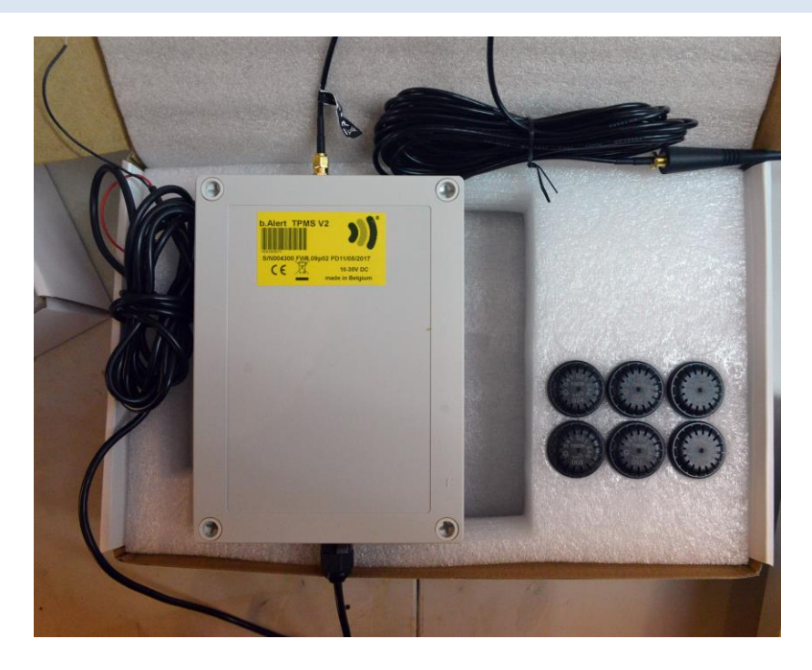
Figure 1 TPMS unit with sensors

The external antenna needs to be placed on the chassis of the truck or trailer where the unit is mounted. It needs to hang in the middle of the vehicle, <u>freely under the chassis</u>.